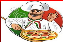
Pizza Party Anyone???